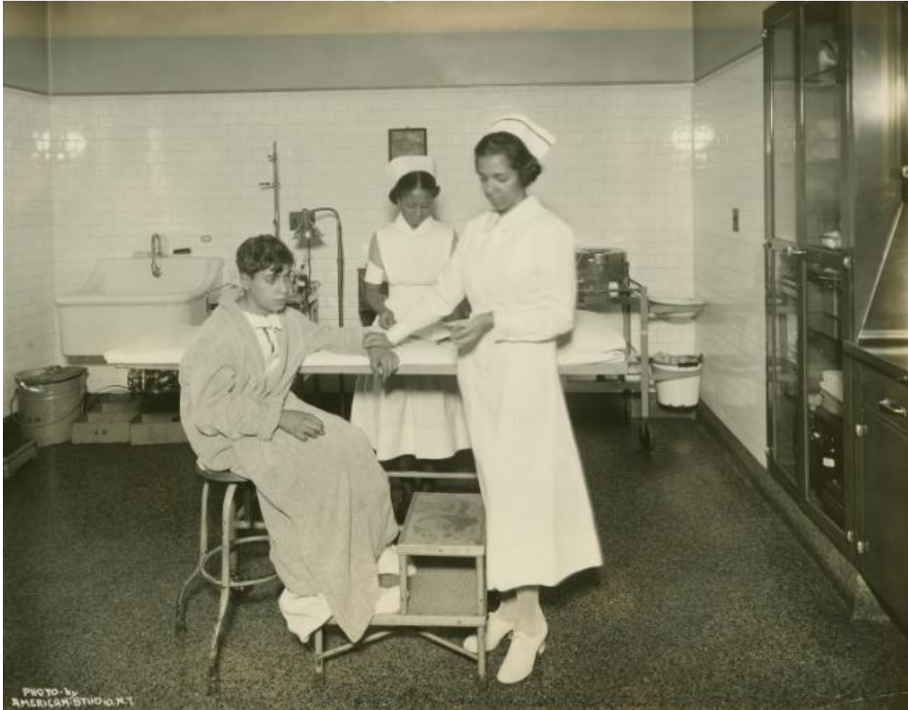
Figure 3. New York Digital Library, 2018