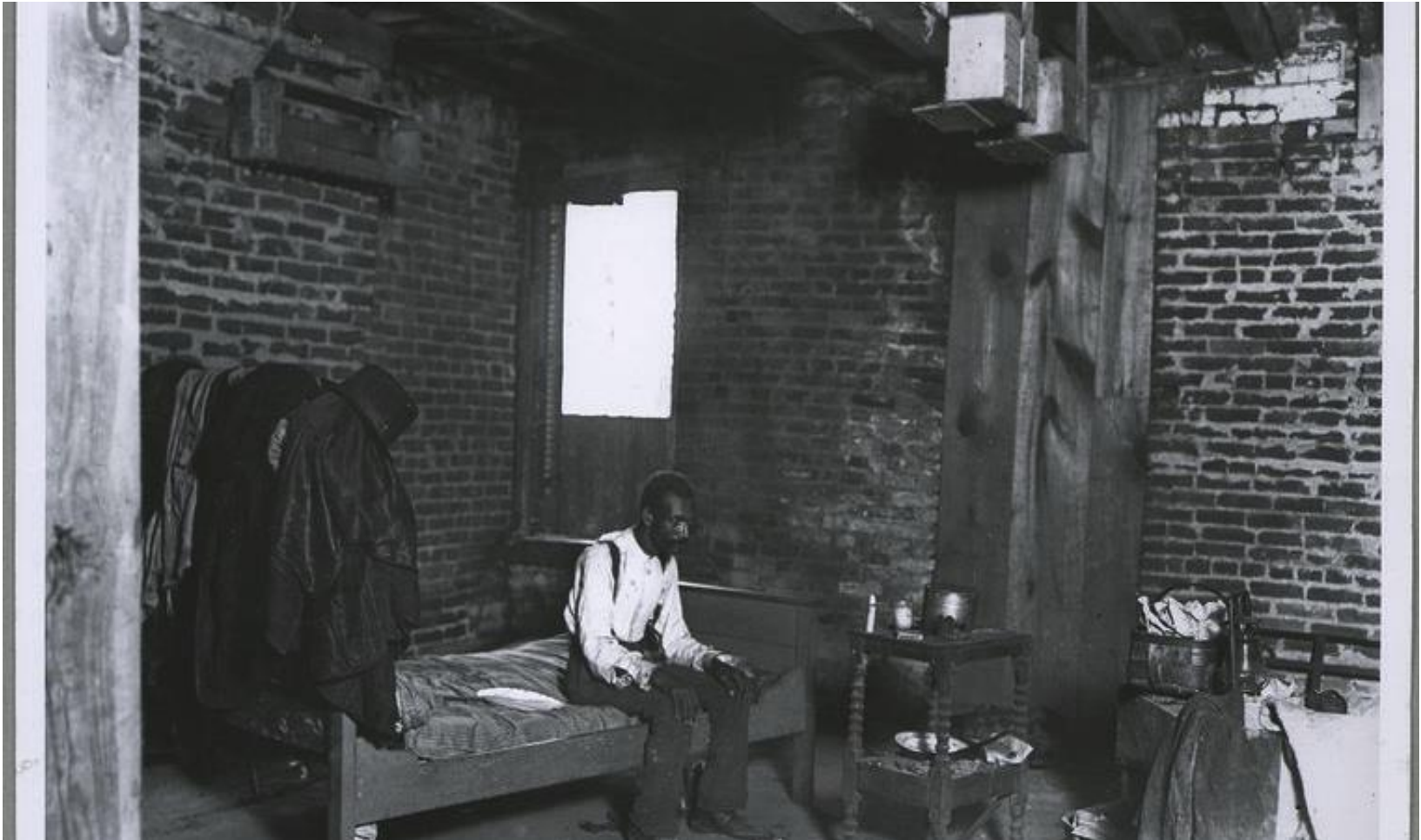
Figure 10. Man With Tuberculosis, New York Digital Public Library, 2018