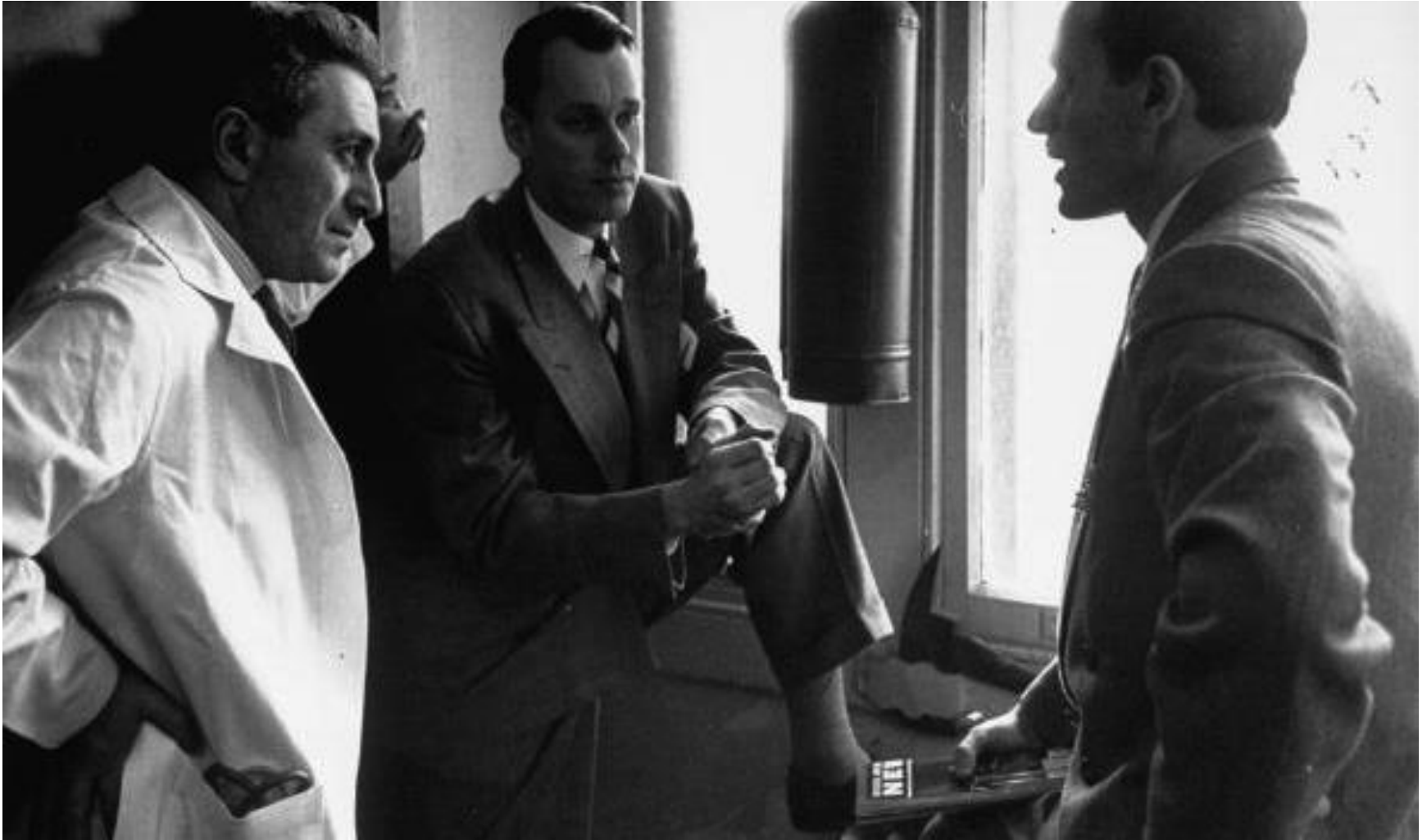
Figure 2. Dr. Robert Robitzeck