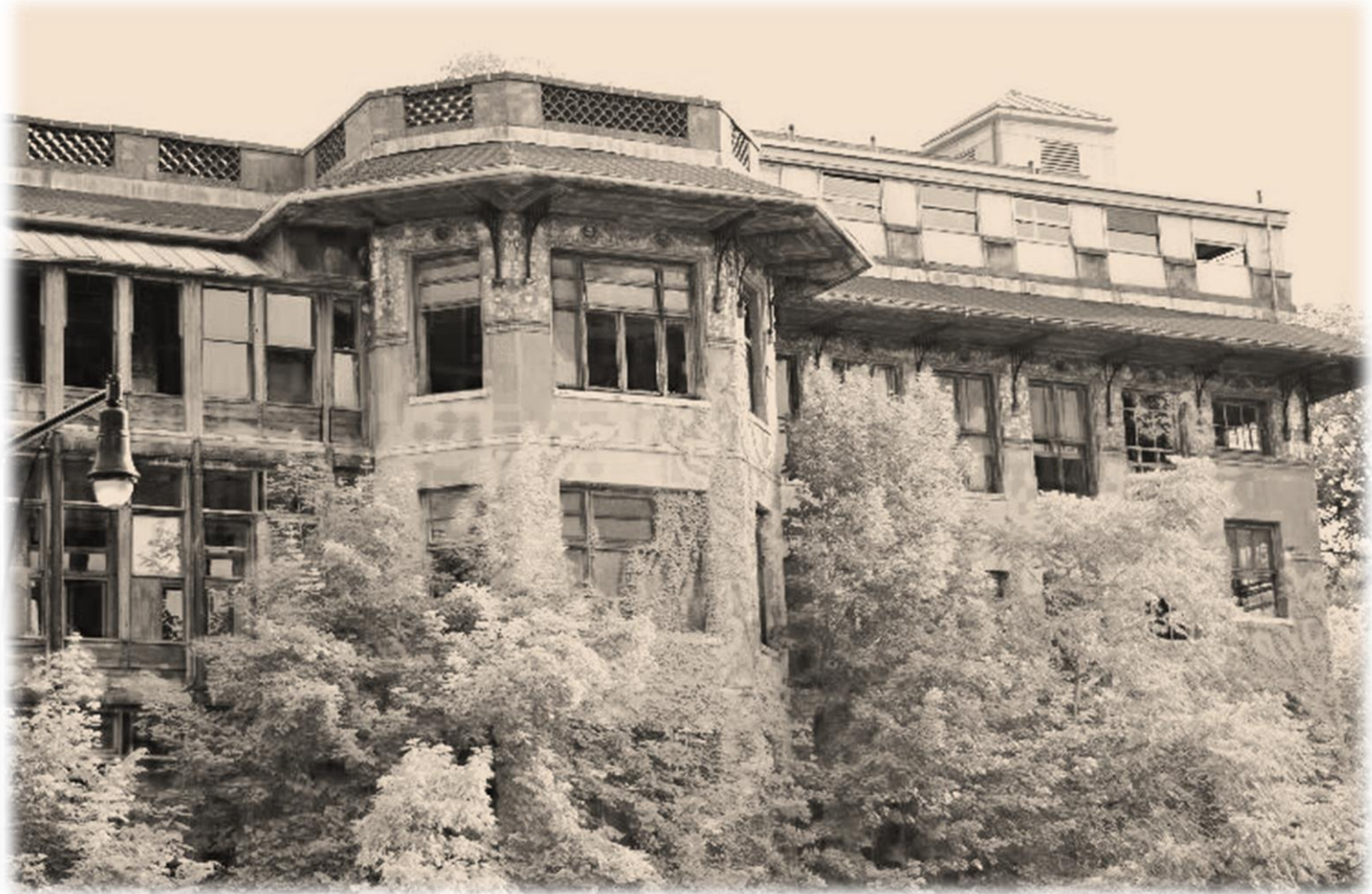
Figure 1. For Nurses By Nurses Productions, 2018