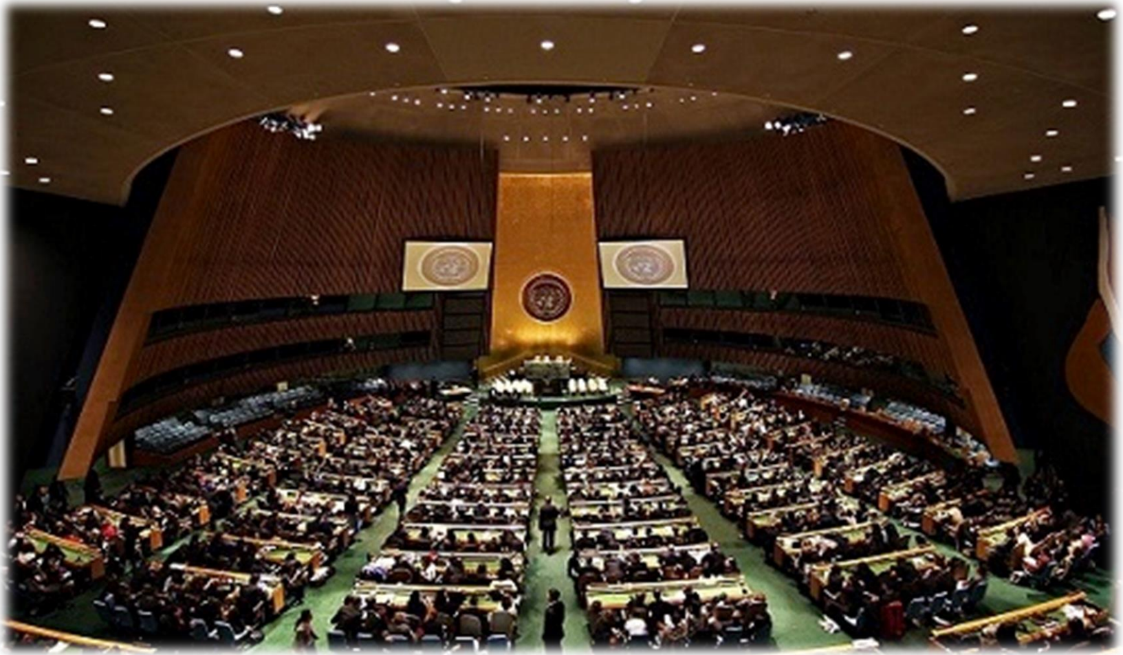
Figure 8. United Nations Assembly, World Health Organization, Sept 2018